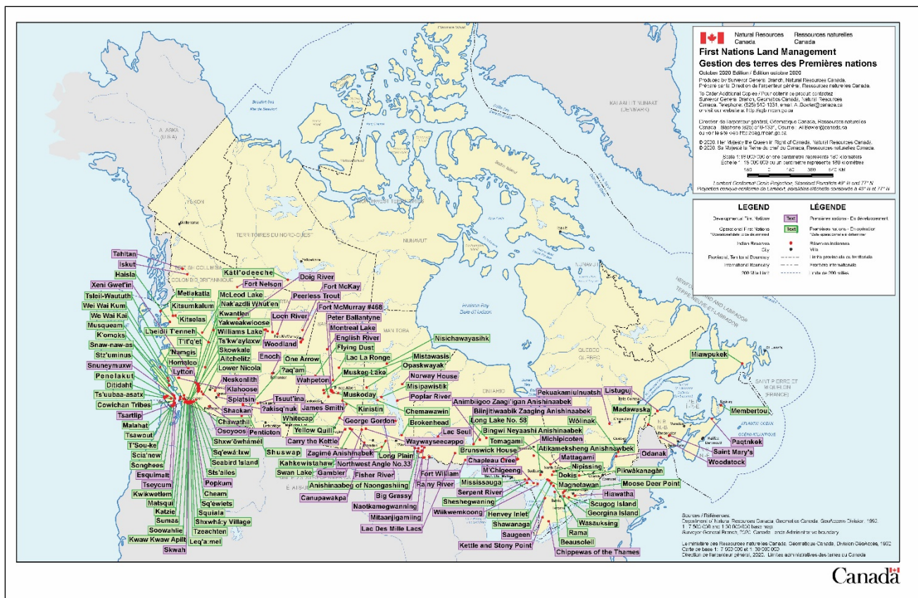
(Please note that this map is updated by NRCAN annually. It was last updated October 2020. The full map can be accessed at https://www.nrcan.gc.ca/earth-sciences/geomatics/canada-lands-surveys/11090 .)

The following map identifies the locations of the Operational and Developmental communities of the Framework Agreement :